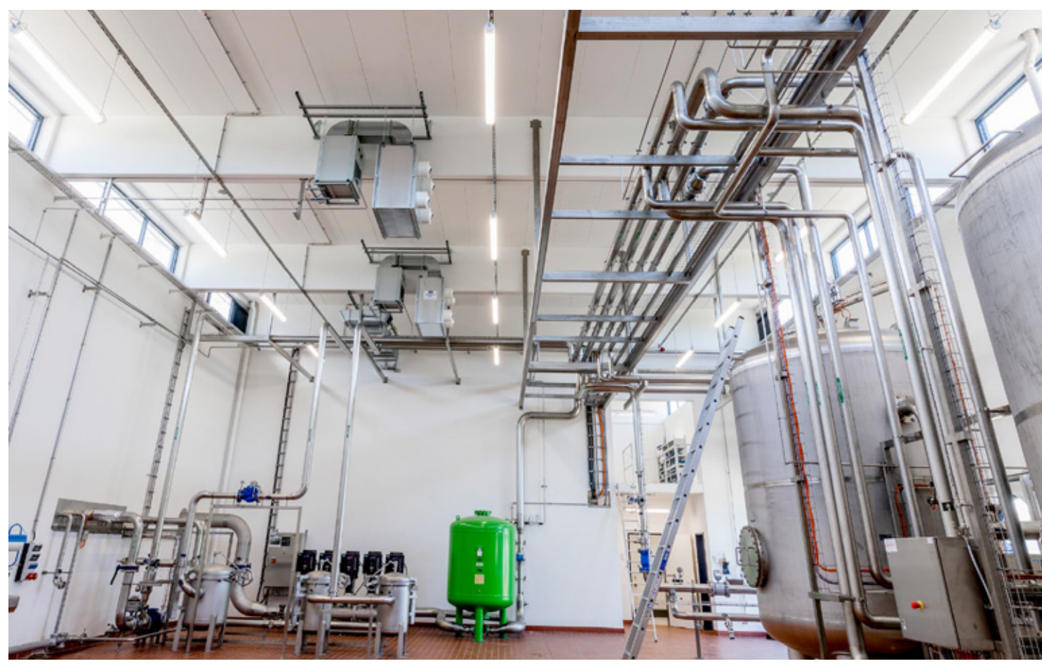
Dairy Gropper GmbH & Co. KG, Bissingen