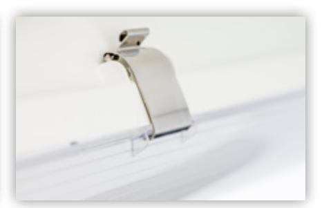
High-quality stainless steel clips