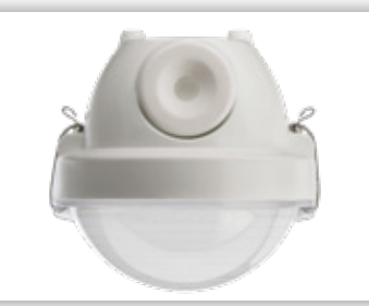
Front cable entry